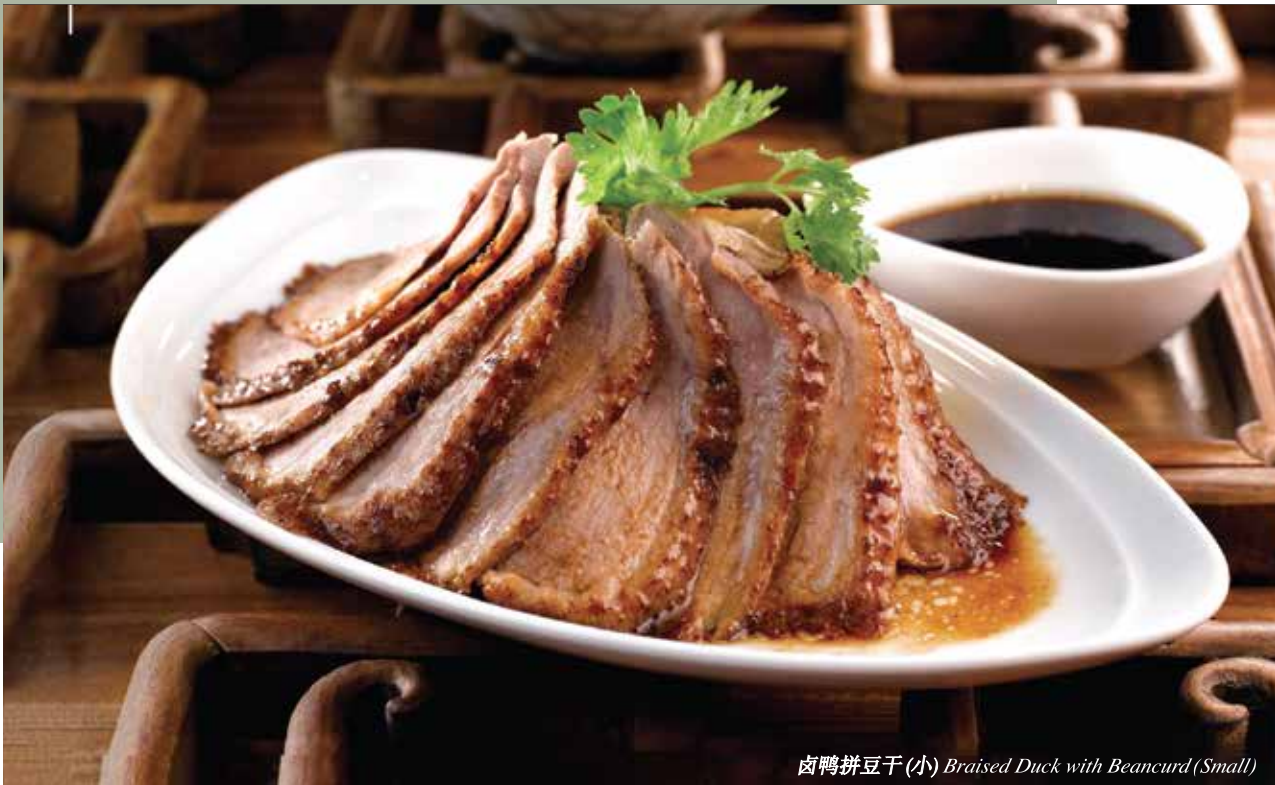
卤鸭拼豆干(小) Braised Duck with Beancurd (Small)