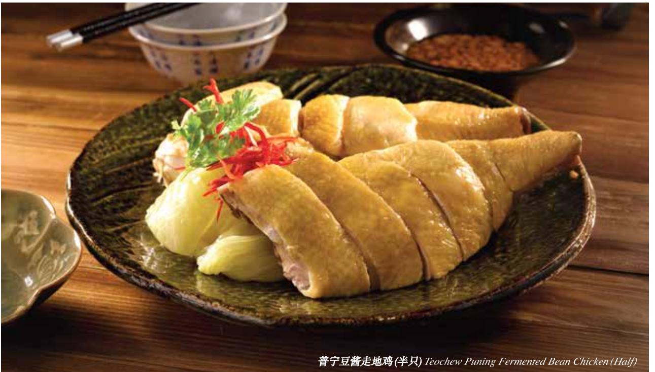
普宁豆酱走地鸡(半只) Teochew Puning Fermented Bean Chicken (Half)